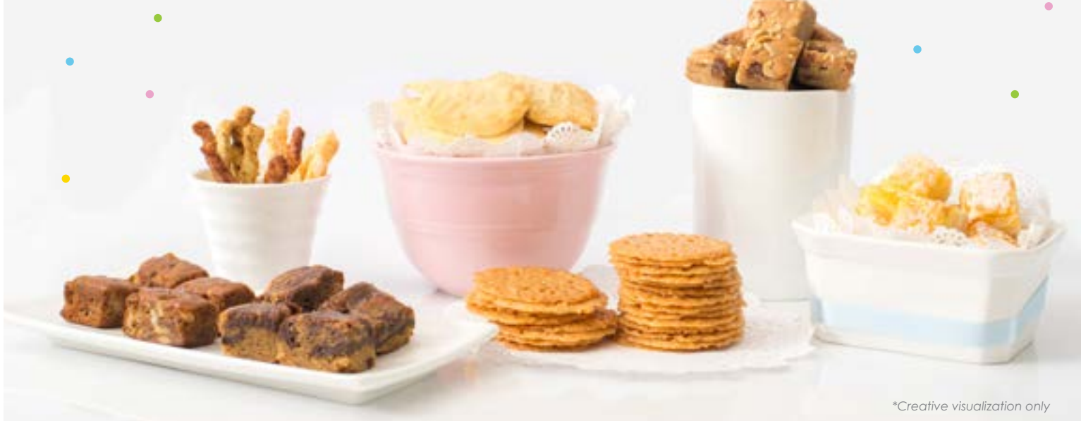
*Creative visualization only